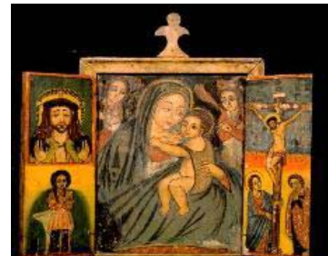
St. Maryum Sion The African/Ethiopian Madonna

MOMS embraces the Ethiopian Holy Mother and Child "St. Maryum Sion" (Zion) who is known in various circles as "The Black Madonna." Her origins are found in Ancient Africa (Ethiopia/Egypt). She is also known as Auset, Meri, Mary and hundreds of other revered names in various circles in Europe, North and South America and Asia. Her son is known as the Savior of the World and in Ethiopia he is called Kerrata Ressay and else where Jesus, Horus, and The Christ.