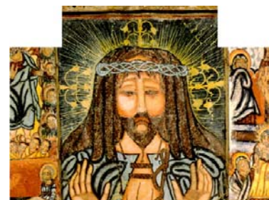
16 th Century painting of the Ethiopian Messiah Kerrata Ressay